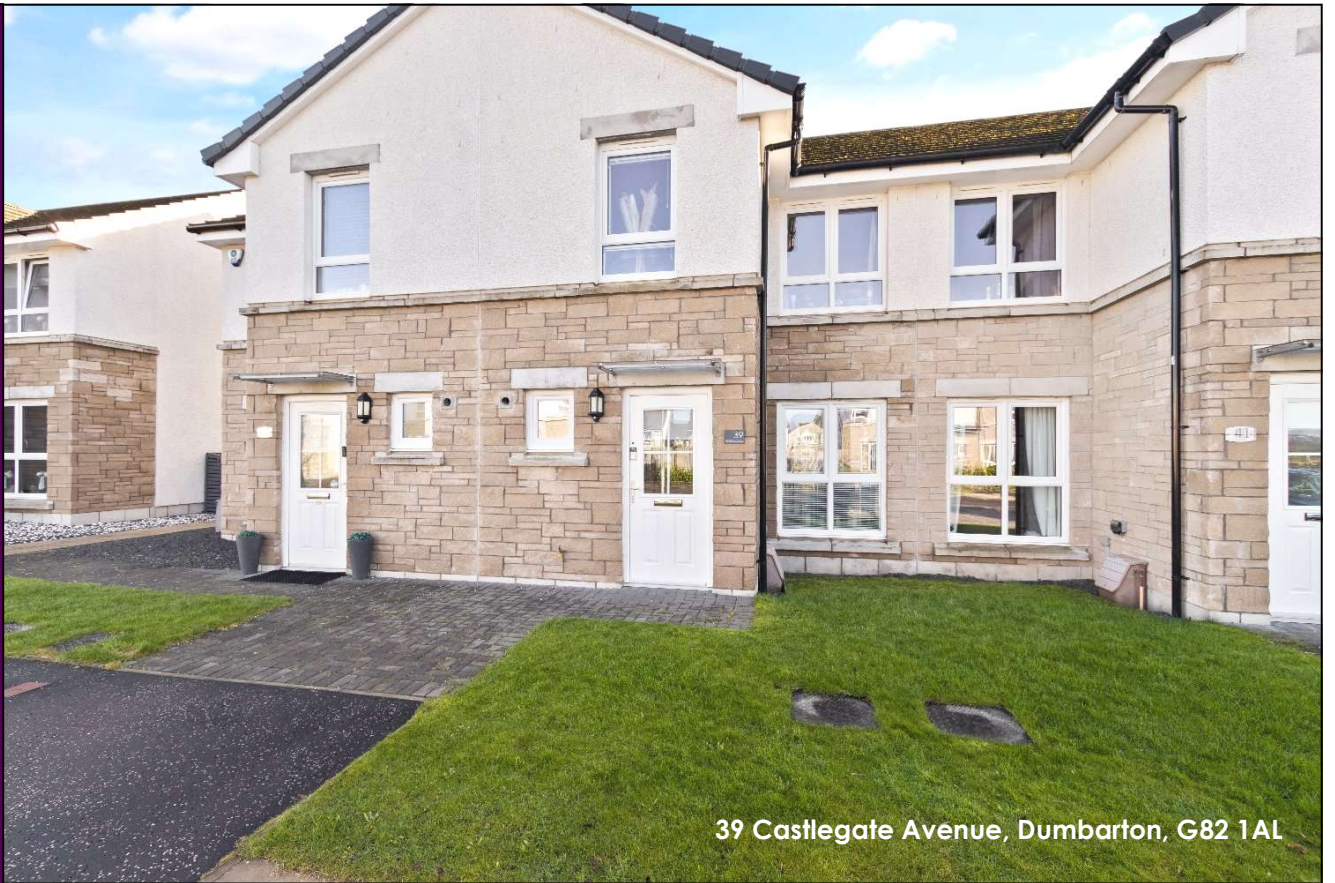
39 Castlegate Avenue, Dumbarton, G82 1AL

Offering to the market this absolute walk in 3 bedroom mid terraced villa. An impressive family home forming part of the Castle Point development built by the renowned Turnberry Homes, circa 2019. This exceptional home has a higher specification with many distinctive fittings, fixtures and features. Decorated to an exacting level with white interior doors, white gloss paintwork complimented by professionally finished wall coverings and white emulsion ceilings. Uninterrupted views of Dumbarton Castle and Rock add to the appeal.